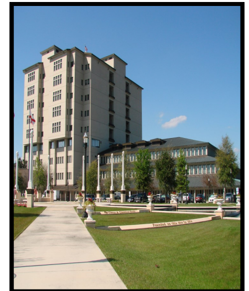
Polk County Courthouse